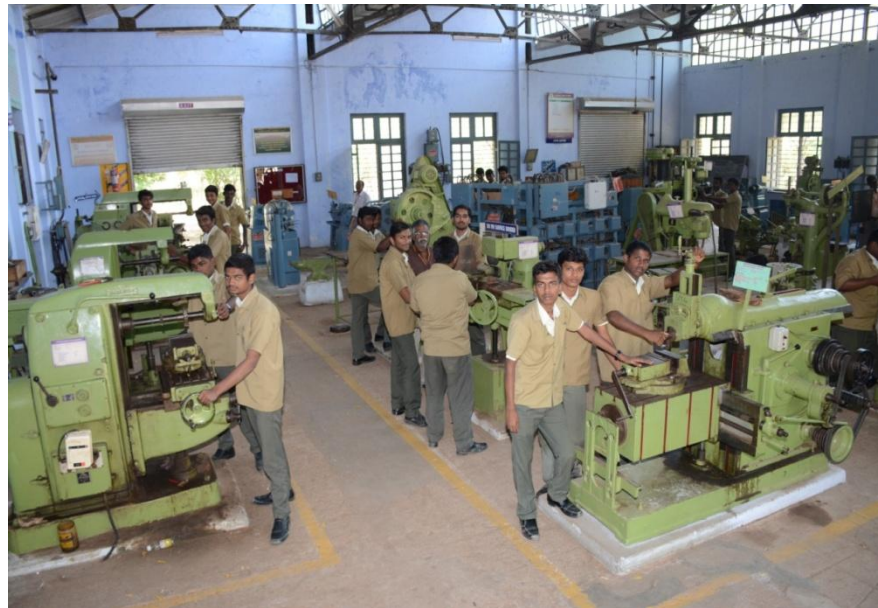
SPECIAL MACHINES SECTION