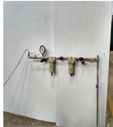
PLASMA ARC CUTTING MACHINE WITH COMPRESSOR AND FRL UNIT