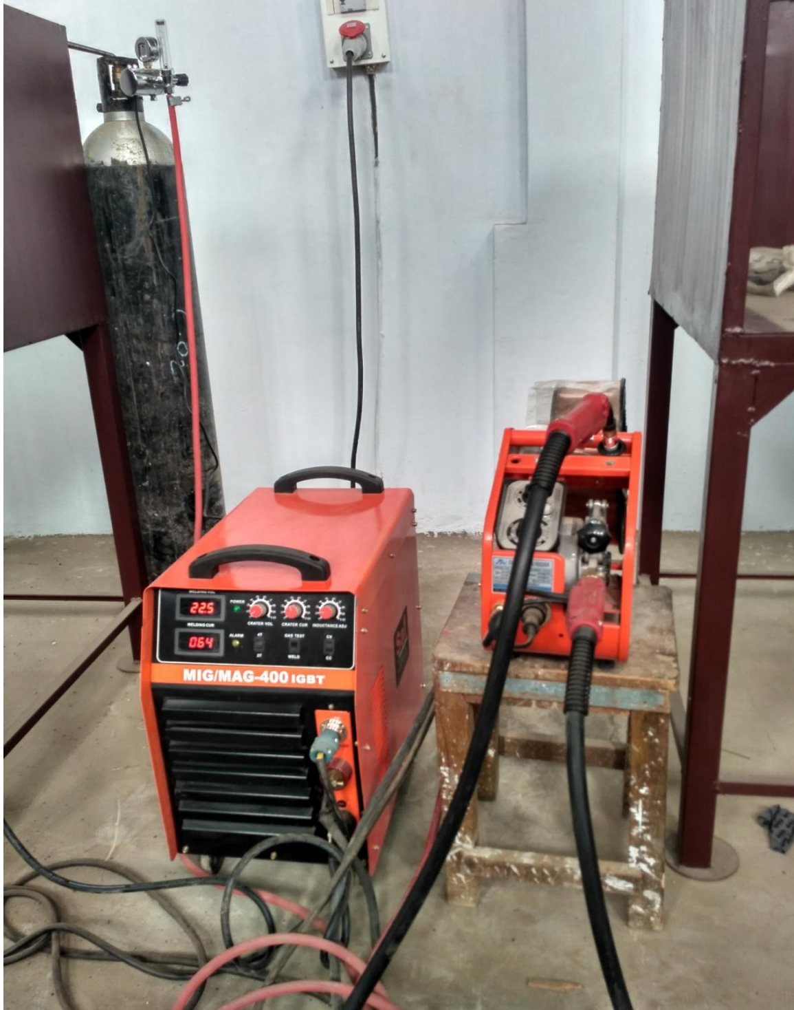
MIG WELDING MACHINE