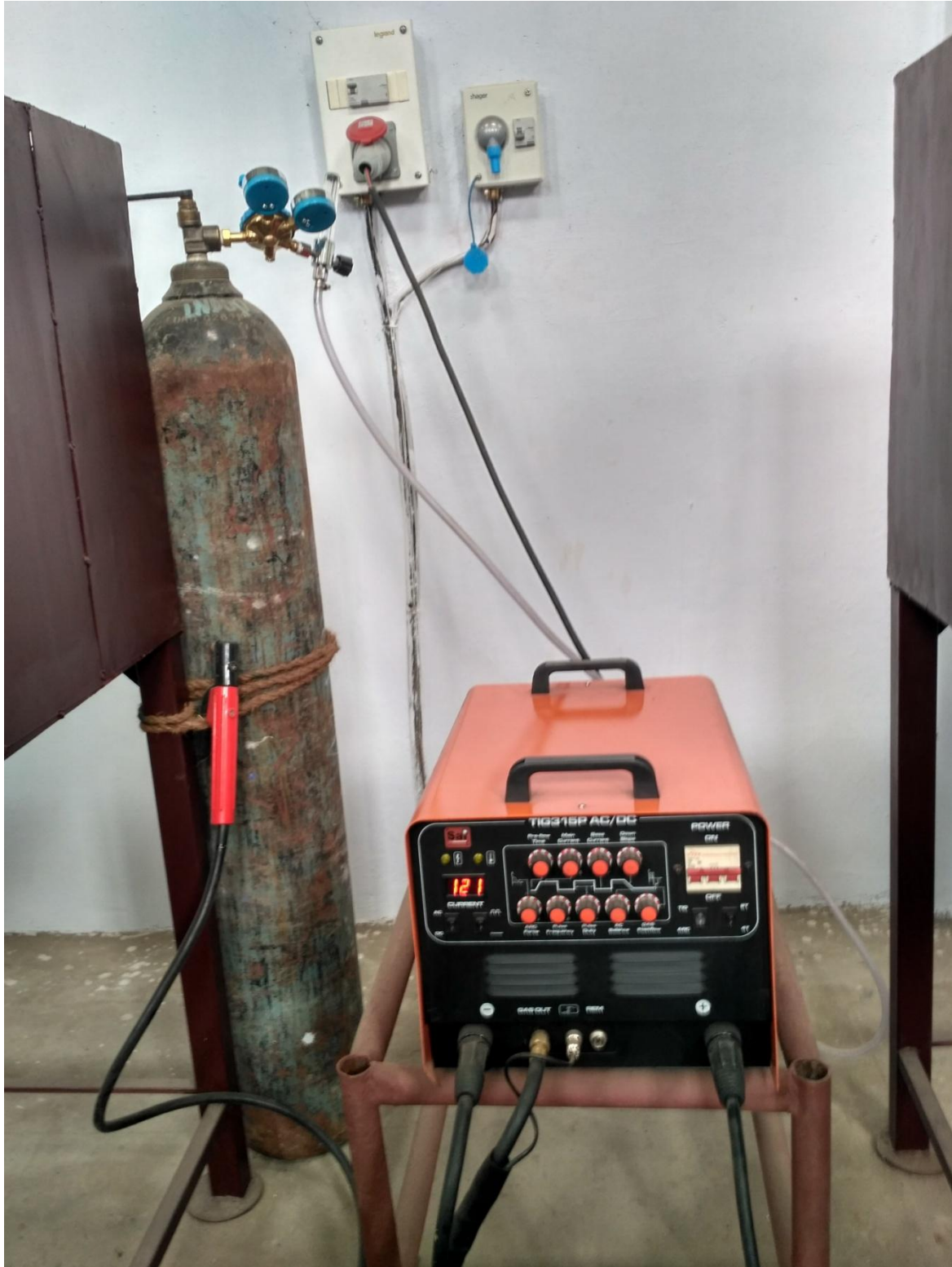
TIG WELDING MACHINE